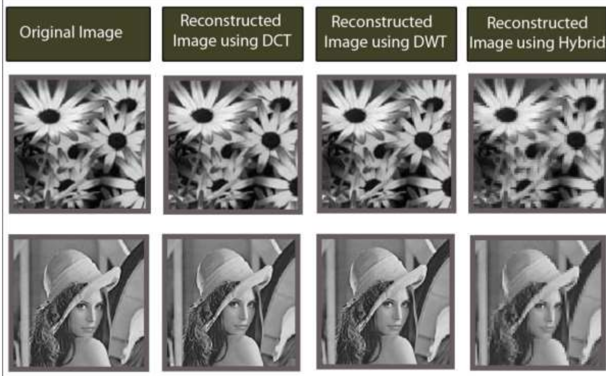
Figure. 3 Comparison of visual image quality of reconstructed image for DCT, DWT AND HYBRID (DCT+DWT) for test images.

The studied algorithms are applied on several types of images: natural images, benchmark images such that the performance of proposed algorithm can be verified for various applications. These benchmark images are the standard image generally used for the image processing applications and are obtained from. The results of the meticulous simulation for all images and are presented in this section. The results are compared with the JPEG-based DCT, DWT, Hybrid (DCT-DWT) algorithms and using Fractals. The algorithms were implemented in MATLAB simulation tool. For the DWT and DCT, MATLAB functions "dwt2" and "dct2" has been considered, respectively. The evaluation parameters (PSNR, CR, MSE and Variance), sub-sampling, quantization and scaling routines were manually programmed in MATLAB. The proposed algorithm is compared with DCT, DWT and Hybrid (DCT-DWT) algorithms. The results are obtained for images of sizes 128x128 and 512x512. Original and reconstructed images are also shown in Figure 3. the compression ratio CR is high for Hybrid transform as compare to standalone transforms. DWT comprises between compression ratio and quality of reconstructed image, it adds speckle noise to the image for improvement in the reconstructed image. Hence DWT technique is useful in medical applications. DCT gives lesser compression ratio but it is computationally efficient compared to other techniques.