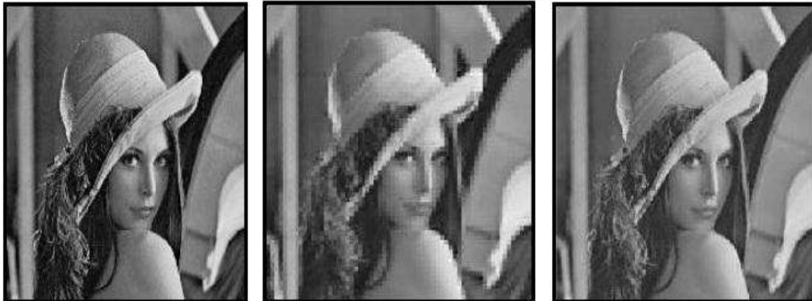
(a) Original image